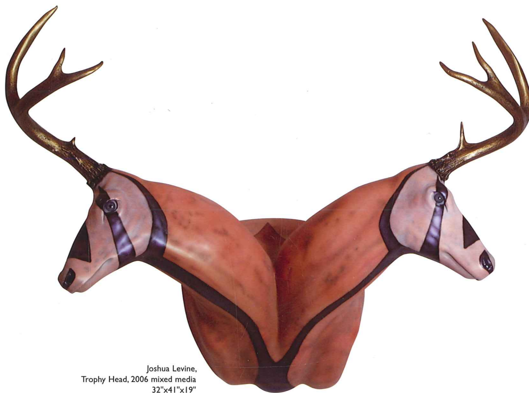
Joshua Levine, Trophy Head, 2006 mixed media 32"x41"x19"